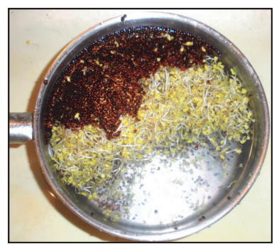
Sometimes hulls need to be cleaned especially on small seeds like this broccoli. Scoot them to the side, grab the clean ones, and return them to the bag for more sprouting.

NEVER USE BLEACH, HYDROGEN PEROXIDE, DETERGENTS OR A HARD BRUSH AS THESE WEAKEN THE HEMP FIBERS.