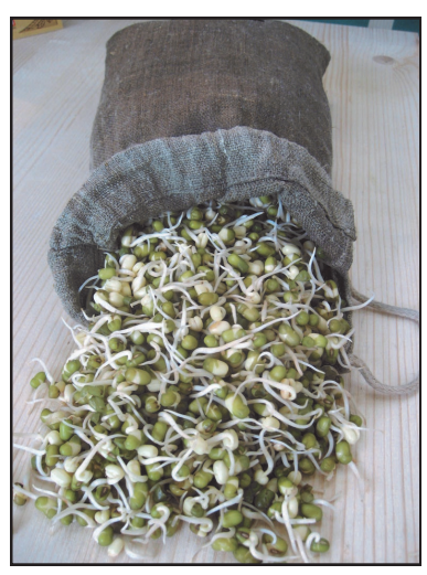
Mung beans are abundant and ideal for your first time sprouting effort using the sprout bag

Sproutman & Co. USA Copyright ©2011 by Steve Meyerowitz