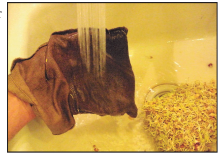
Rinse the bags inside out under hot tap water.

If you see cloudy water, mold, or detect a sour smell when rinsing, throw out the batch and sterilize your sprout bag. Place it in a pot of pre-boiled water for 5 minutes with the flame off. Hang the hot sprout bags or lay flat on a dish rack to dry. Remove any remaining sprout hulls or roots once the bags are fully dry.