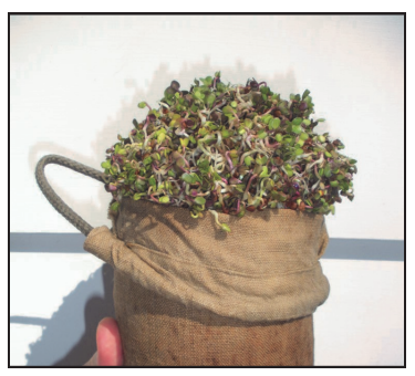
Mature radish sprouts. They get light on the last 2-3 growing days and get pretty green.