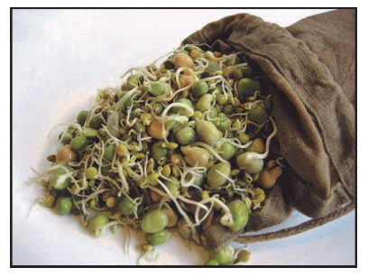
Crunchy bean mix. A perfect marriage of red and green lentils, green peas, and chick peas. Easy, fast-growing, and delicious.

If you make "seed cheese" recipes, you can use the sprout bag. Just make sure all the leftover particles are washed away. Turn the bag inside out and rinse