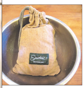
Leave hanging or set in a bowl after dripping stops

4. After the 8 hrs., pour the soaked seeds into the wet, pre-washed sprout bag. Pull the draw string closed. Rinse by dipping the bag into a bowl of water or soaking it in the sink. Soak for at least 1 minute. Then hang it on a hook or knob or lay it in the dish rack or dishwasher rack. 5. Rinse twice per day, about 12 hours apart. Think of feeding them (watering) when you have breakfast and dinner. Just dip and hang! It only takes a minute! You've now got the basic steps.